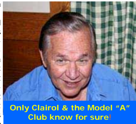
Only Clairol & the Model "A" Club know for sure!

we discussed making the Die Hard more festive by embracing the holiday season. Trinity Lutheran Church, where we have our meetings, provides support for 8 – 12 families that are in need and based on your response at the last meeting, I know you would like to help. I have been speaking with a person on their board and I expect more specifics that I can share with you. Hopefully we can have a list of items we can donate by the November meeting so we can bring them to the Die Hard. We would also like to have a chili cook-off at the Die Hard. Any one who would like to bring a big pot of chili in lieu of